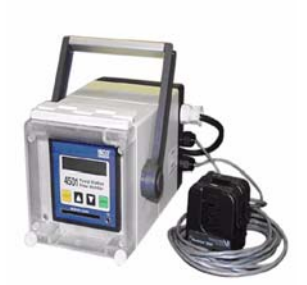
4501 Pump Station Monitor