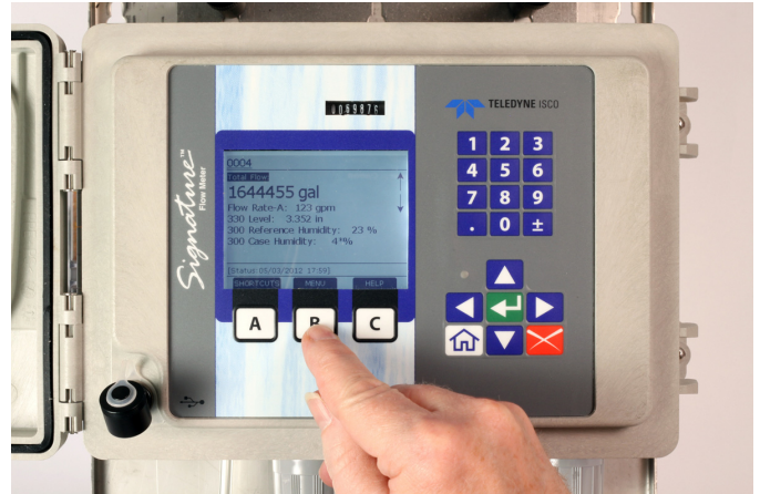
IP66/NEMA 4X panel offers protection against entry of dust or water during meter programming