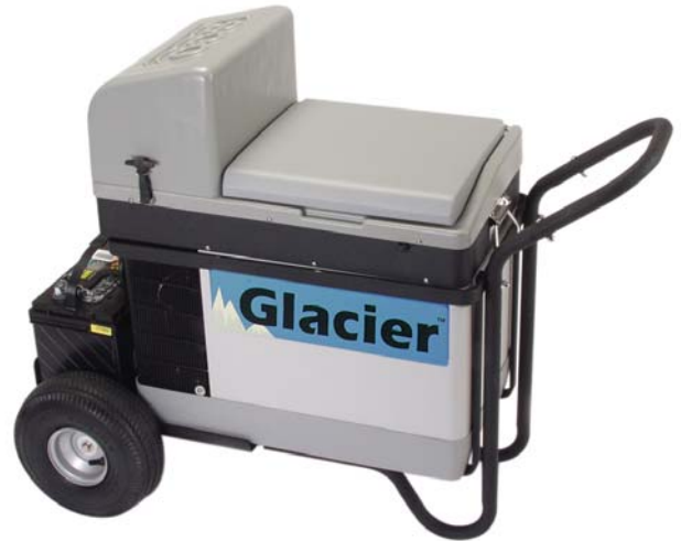
Above: Our optional mobility kit, with pneumatic tires, carries a 12V battery and lets Glacier roll easily over rough terrain.