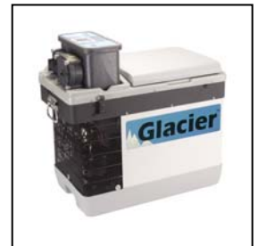
Right: Under the cowl, a NEMA 4x, 6 (IP67) enclosure protects the detachable controller.